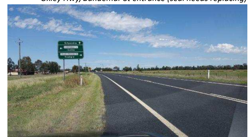
Navigation Sign (Oxley Highway west)