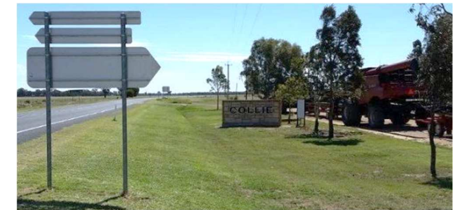
Collie Village Sign (east approach) (reduced visibility/location)

As stated above, perhaps some white on blue Facilities signs would be the best outcome showing Collie has food, accommodation, and potentially camping would be sufficient.