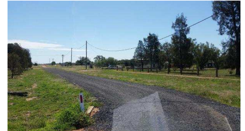
Wambianna St (seal to Calga St, drainage, and street trees)