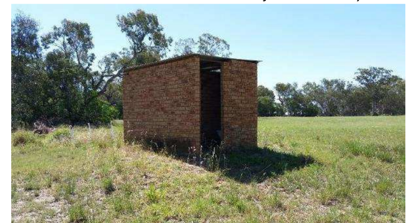
Basic toilet block not inspected internally (check if repairs needed)