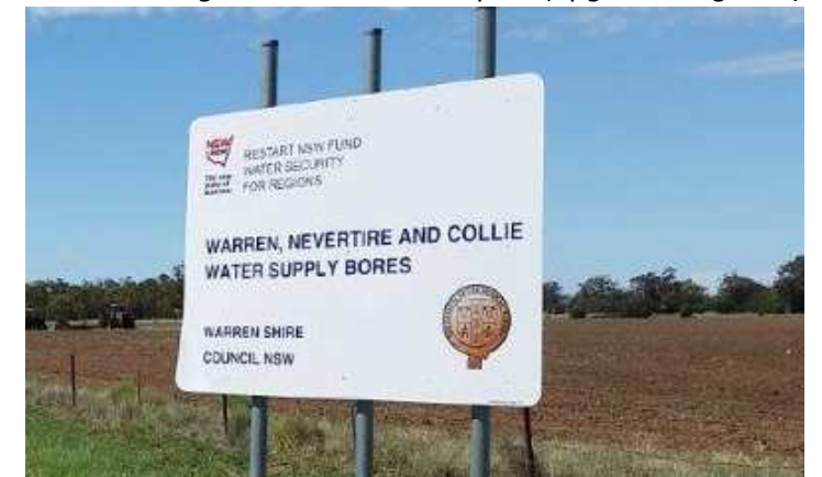
Recently updated bore water supply to Collie