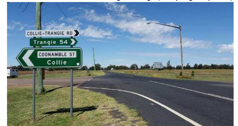
Collie-Trangie Rd / Coonamble St Intersection (clear signage)