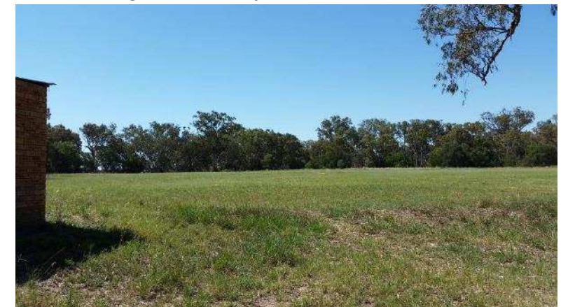
Recreation oval flat and recently mown