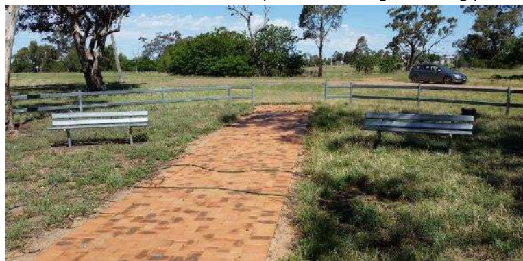
Seating (needs paved area to/around seating for access)