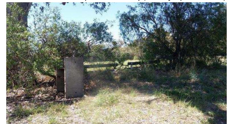
Old BBQ/worn seating (needs replacement if demand)