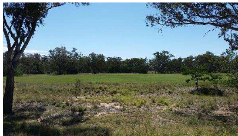
Recreation ground viewed by Coonamble St/Collie Bridge