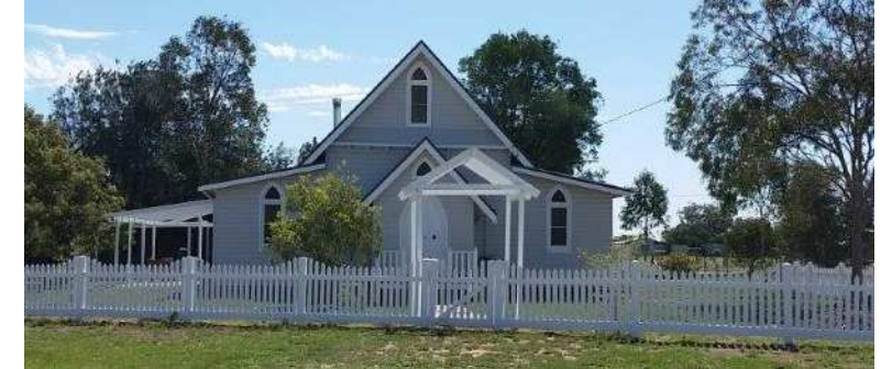
Former Anglican Church (1920) adaptively re-used as dwelling