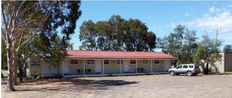
Accommodation (potential to promote by donation camping nearby)