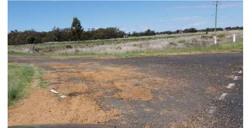
Oxley Hwy/Bundemar St entrance (seal needs replacing)