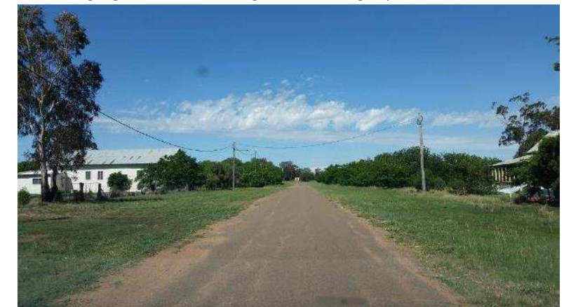
Bundemar St (upgrade seal, drainage, and street trees)