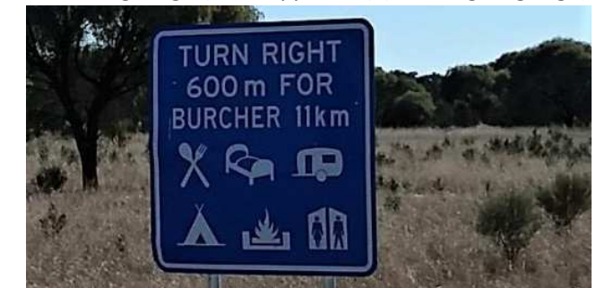
Example Key Facilities sign suitable for Oxley Hwy (both approaches)