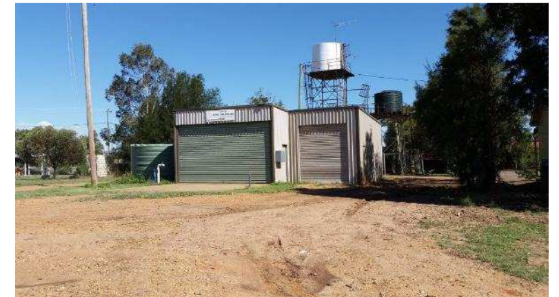
Rural Fire Services Shed (confirm if any action required)