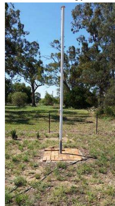
Memorial obelisk, path and flag-pole to one side