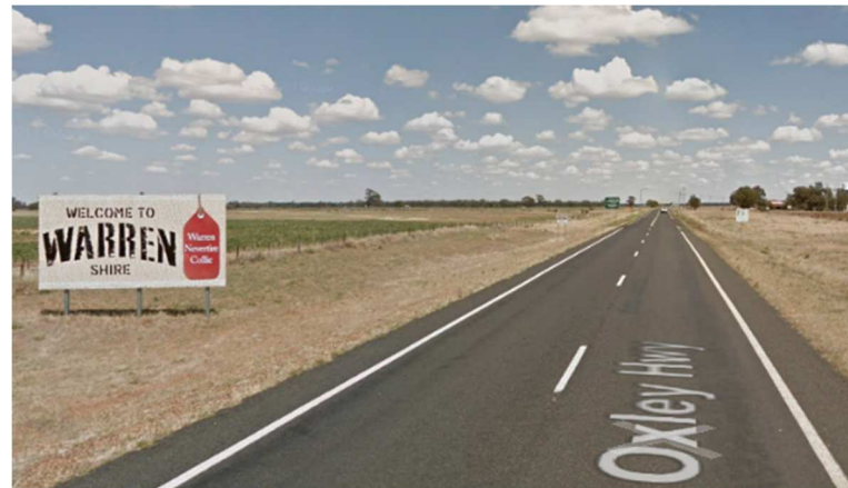
'Welcome to Warren Shire' sign (Oxley Highway east – Google)