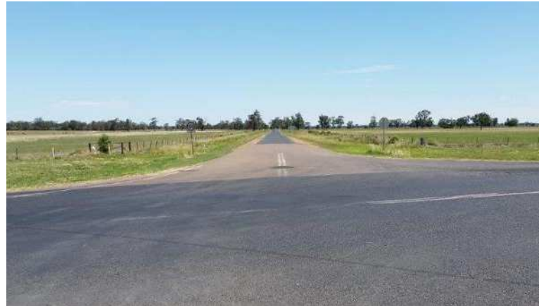
View South along Collie-Trangie Rd