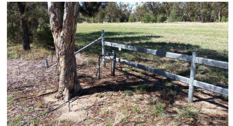
Water is available for irrigation