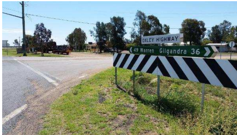
Oxley Hwy signage visible at Intersection