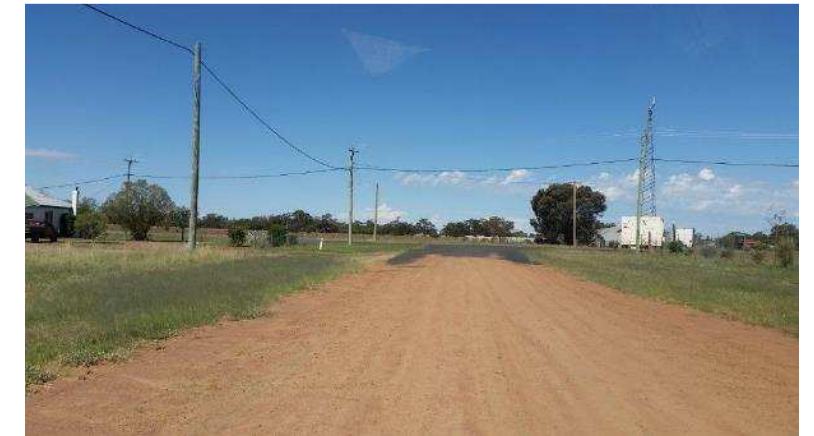
Inglega St (seal to Calga St, drainage, possible street trees)