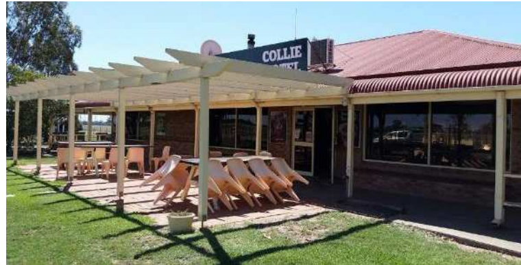
Collie Hotel (potential to increase 'pub tourist trail' and accommodation)

The community wants more general clean-ups to remove rubbish, open up lanes & encourage owners to do the same (but Council has limited powers to enforce works on private land).