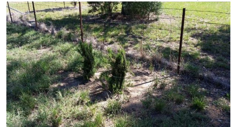
New plantings may need landscape plan / species selection