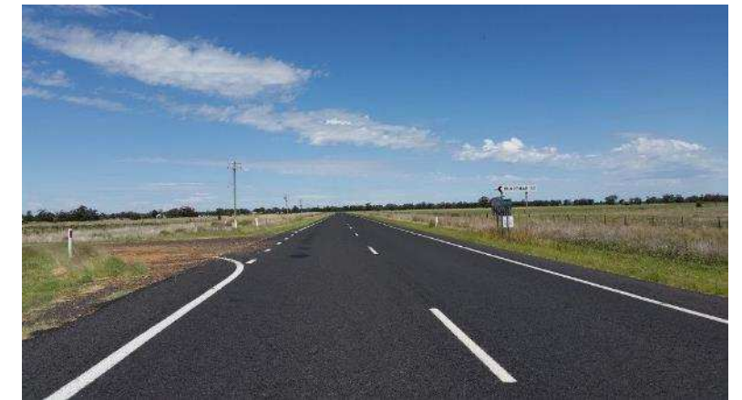
Oxley Hwy/Bundemar St (west entrance – local traffic only)