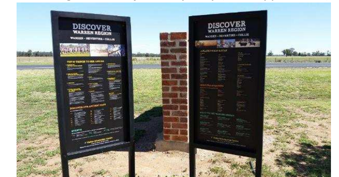
Existing Information Signs (potential for more local information)