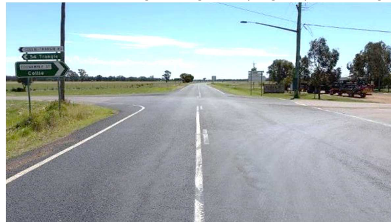
Collie-Trangie Rd / Coonamble St Intersection (limited visual cues)