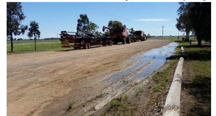
Drainage issues in hotel car-park (upgrades & gravel)