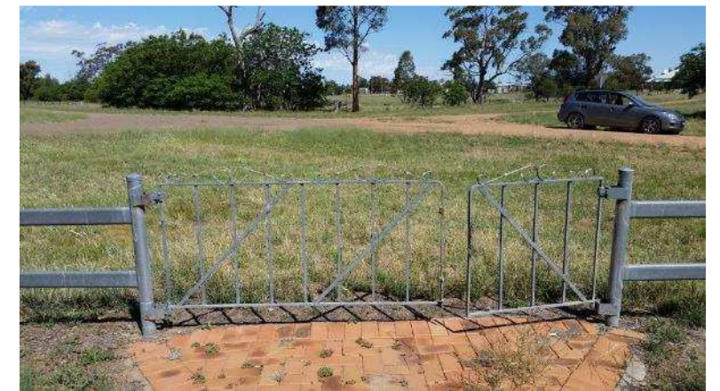
Entrance gates (add accessible car space / parking area)