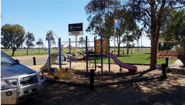
Playground (add barriers to carpark & shade tent if not private land)