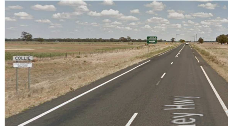
Collie Village Sign (Oxley Highway east limited visibility - Google)