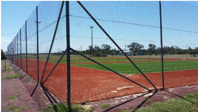
Tennis courts in good condition (provide shade planting around perimeter)