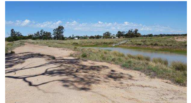
Water storage dam to west of village

There is no substantial need for street furniture as key facilities are spread out and tend to provide their own seating. If the sportsground is reactivated some replacement seating may be required. Some additional 240L Sulo Bins in the hotel car-park, Memorial Park, and Recreation ground may assist.