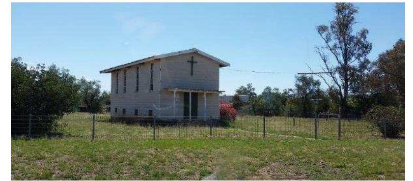
Collie Catholic Church (1953) (protect as historic item)