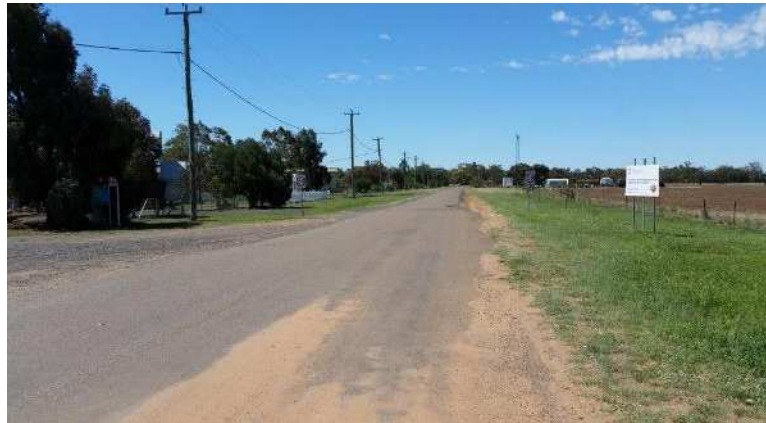
Coonamble St (street tree plantings & drainage upgrades)