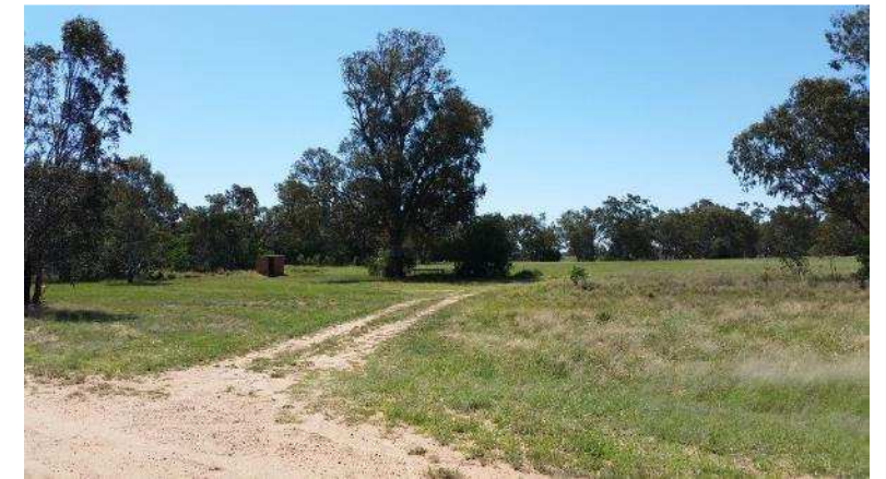
Recreation ground viewed from Wonbobbie St / entrance track