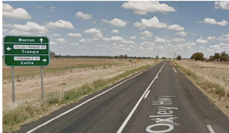
Navigation Sign (Oxley Highway east - Google)