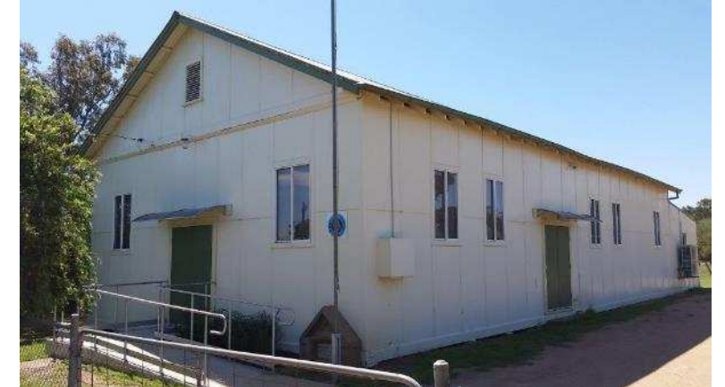
CWA Hall in great external condition (support CWA to maintain)