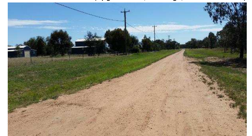
Wonbobbie St (seal to Calga St, drainage, possible street trees)