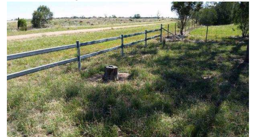
Tree stumps suggest new plantings may be needed for shade