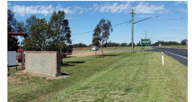
Collie Village Sign (west approach) (no village signage)