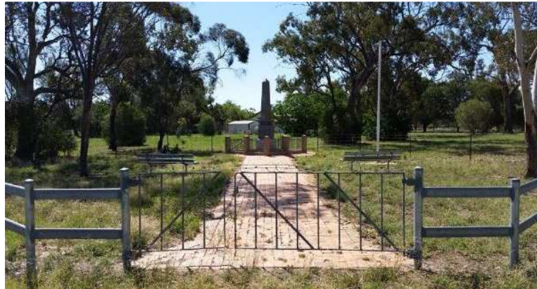
War Memorial Path (needs weeding/resetting pavers)

Council's role should be to facilitate the community to manage the park. Subject to discussion with the community, some perimeter shade tree plantings and/or small ornamental planting beds may be suitable.